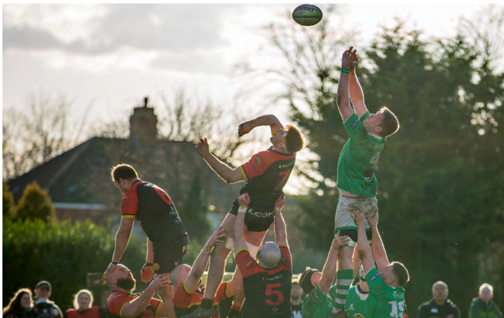
An unusual line out clearly won by the Greens