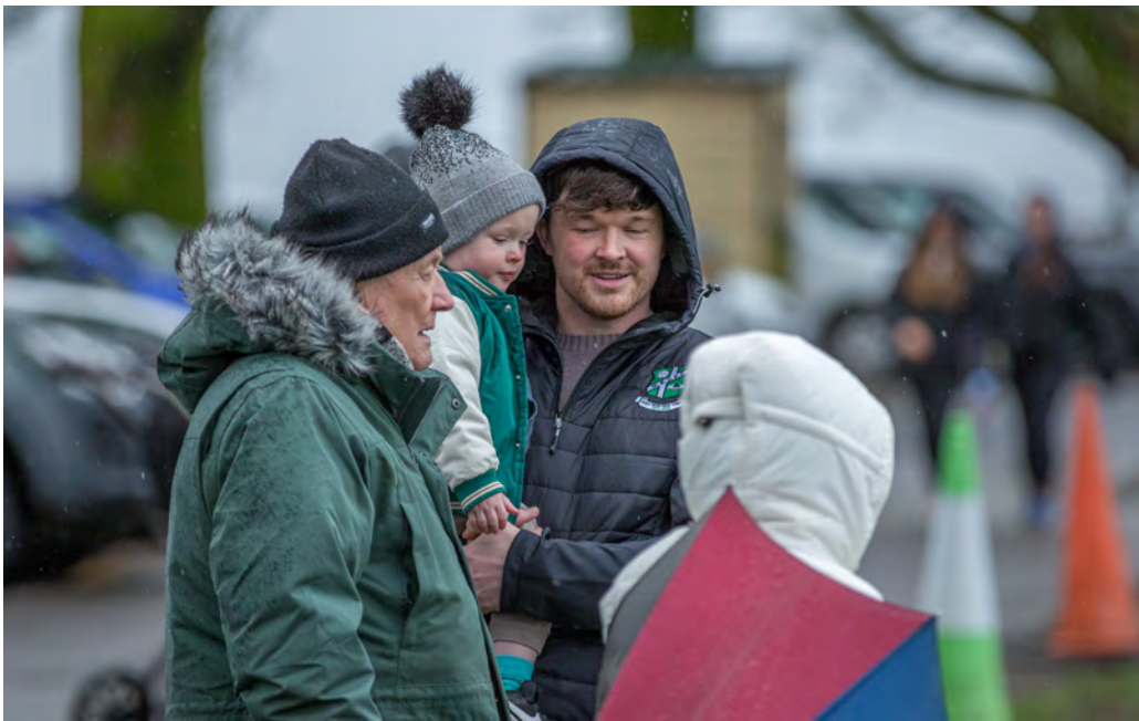
The Tyndedale match sponsors, the Bullough family